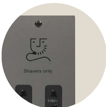
Black Nickel (BN)