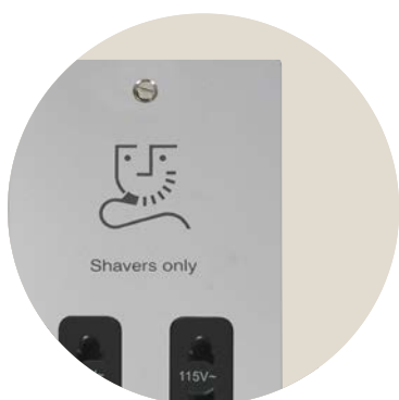
Polished Chrome (CH)