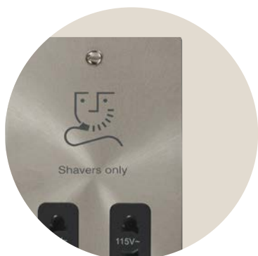
Brushed Steel (BS)