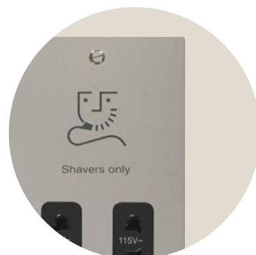
Pearl Nickel (PN)