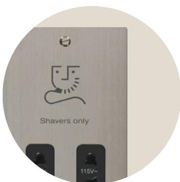
Stainless Steel (SS)